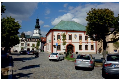
Struktura 2019 Hotel Jehla Žďár nad Sázavou June 10-13, 2019