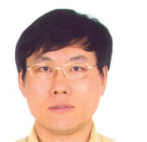
ChangQing Jin CCM