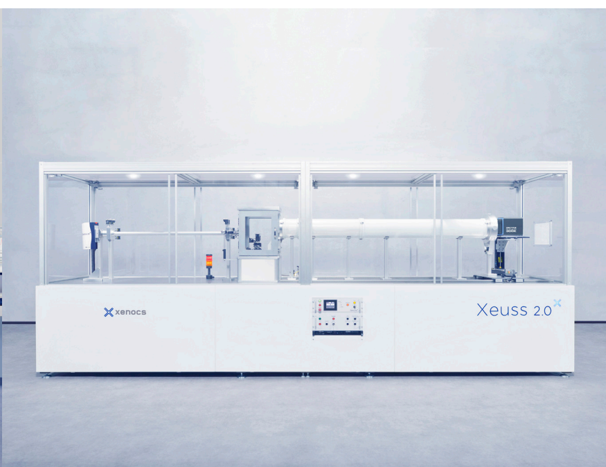
Xeuss 2.0, the SAXS/WAXS laboratory beamline

Our mission : to provide solutions for nanoscale characterization of materials