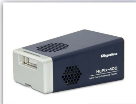
HyPix-400: 2-dimensional semiconductor detector