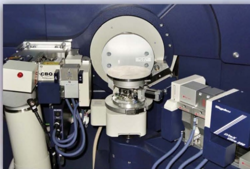
Unique 5-axis goniometer