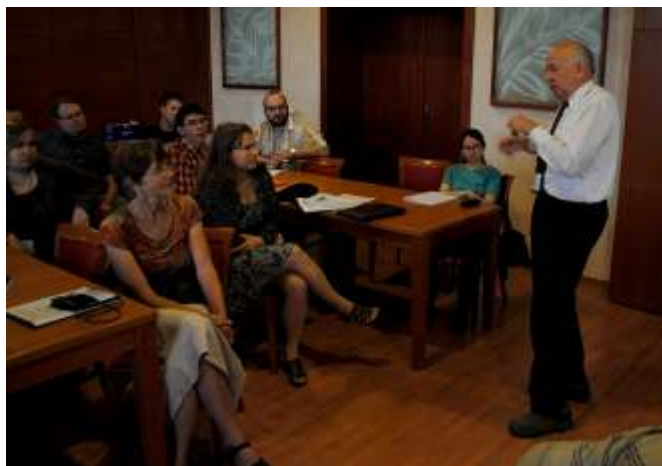
Struktura 2011 (more pictures can be found in issue 4).