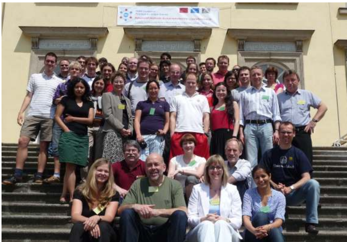
FEBS course 2010.