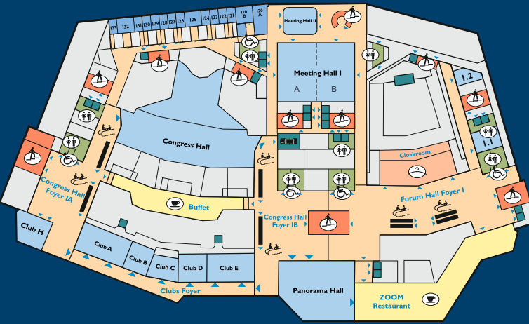
The first and second floor