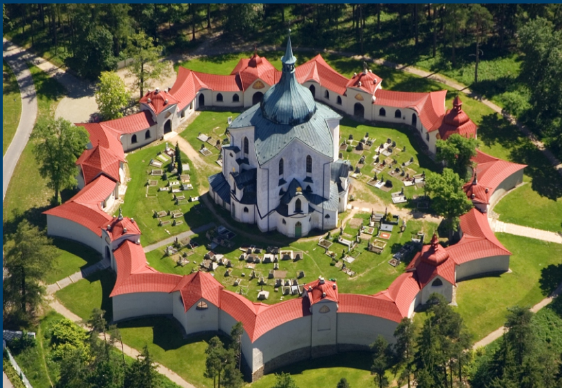
Pilgrimage Church of St. John of Nepomuk at Zelená hora – unique Baroque Gothic building