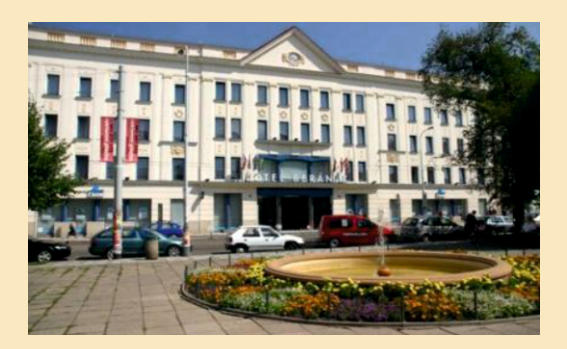
Beranek ***, 15 min, 1 metro stop, 80 persons

A modern hotel providing the highest standards of comfort throughout the full spectrum of services, the Corinthia Hotel Prague is characterised by quality, style and the closest attention to the guests needs. 539 rooms on 24 floors