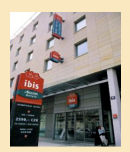
Ibis Old Town ***, 20 min, 5 metro stops, 271 persons

Ibis Wenceslas sq. ***, 15 min, 1 metro stops, 181 persons