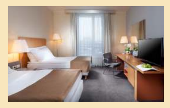
The modern, four-star Holiday Inn Prague Congress Centre Hotel is located in the peaceful surroundings of historic Vyšehrad and its national cultural monuments, and also very close to the Prague Congress Centre, 251 modern rooms