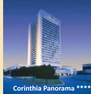
Corinthia Panorama **** 15 min, 1 metro stop, 450 persons

Ibis Wenceslas sq. ***, 15 min, 1 metro stops, 181 persons