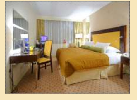
A modern hotel providing the highest standards of comfort throughout the full spectrum of services, the Corinthia Hotel Prague is characterised by quality, style and the closest attention to the guests needs. 539 rooms on 24 floors